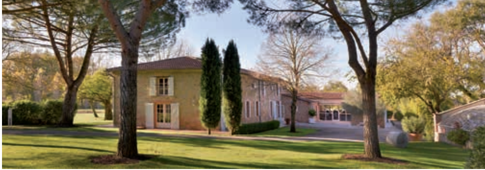
The Pierre Fabre Foundation Headquarters in Lavaur (Tarn)